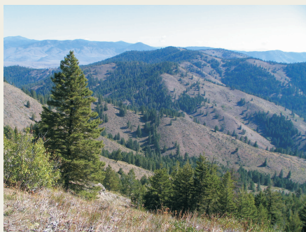
A view of the upper Smith Ridge/McClure zone currently not being considered for protection by the Forest Service.

Now is the time to contact the Forest Service, and tell them they made a mistake and need to redraw the Lookout Mountain potential wilderness boundary to include the actual roadless area. Write a letter to the Methow Ranger District, with a copy to the Supervisor's office, and tell the Forest Service to correct their error, and correctly map and protect this region (you can find their addresses on the www.lookoutroadless.org website). Also mention to friends that this area needs our attention, and encourage them to check out its beauty. We have a shot at keeping this amazing area wild.