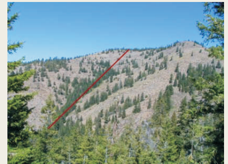
the forest service claims the land to the left of the red line is potential wilderness, and to the right is not...

A squiggle on a map here, a line there, and wilderness is protected, or forgotten. The Forest Service will finalize their Forest plan in the next year or so, determining their management practices for a long time to come, and the fate of the 18,000+ acre Lookout Mountain Roadless Area hangs in the balance. Will it fill with new roads, as the provisional draft of the plan allows? Should only a quarter of it be considered "potential wilderness", as the Forest Service currently claims? Or should all of it be designated wilderness, as conservationists wish? Will we succeed in passing this amazing region down intact to the next generation?